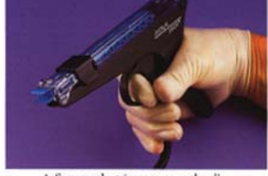
1. Squeeze the trigger to open the clip.