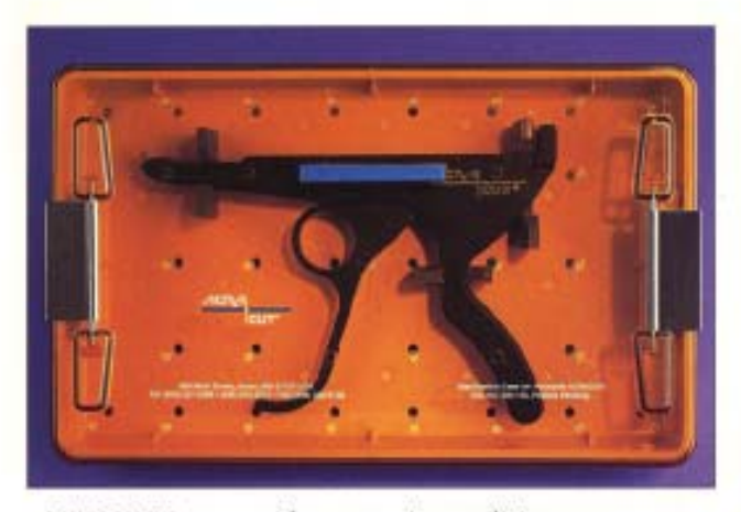
ACRAGUN comes with a protective sterilizing storage case. Catalog No. 300-100