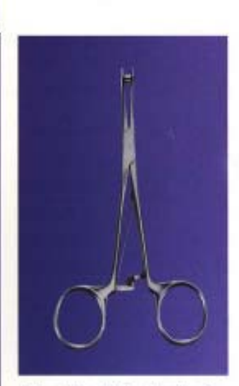
Reusable stainless steel scalp clip applier/remover. Catalog No. 500-135