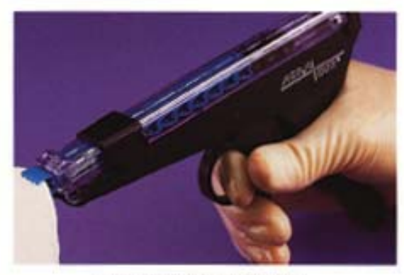
2. Apply the clip to the scalp.