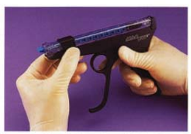
2. Lock the cartridge in place and the first clip slides into position, ready to use.