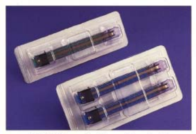
ACRACLIPs come in single cartridge or double cartridge sterile blisterpacks. Each cartridge contains 15 clips. See chart at left