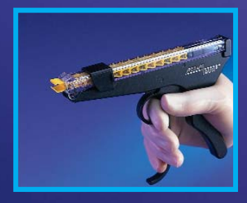
ACRAGUN Comfortable and easy to use