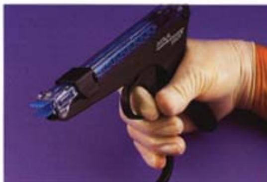
1. Squeeze the trigger to open the clip.