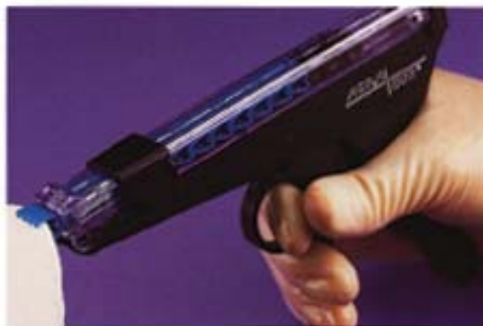
2. Apply the clip to the scalp.