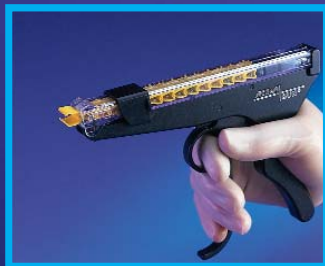
ACRAGUN Comfortable and easy to use