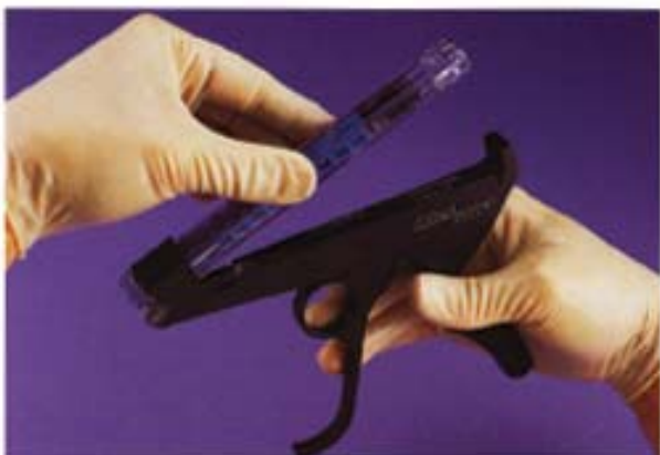
1. Snap the preloaded sterile cartridge into the ACRAGUN.