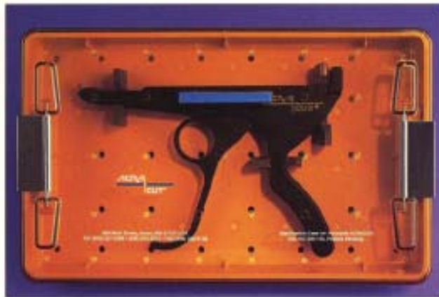
ACRAGUN comes with a protective sterilizing storage case. Catalog No. 500-100