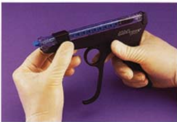
2. Lock the cartridge in place and the first clip slides into position, ready to use.