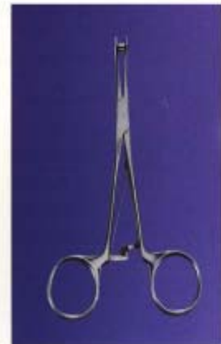
Reusable stainless steel scalp clip applier/remover. Catalog No. 500-135