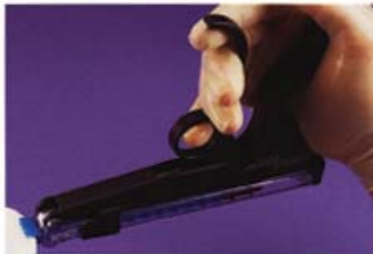
3. ACRAGUN can apply clips at any angle - even upside down.