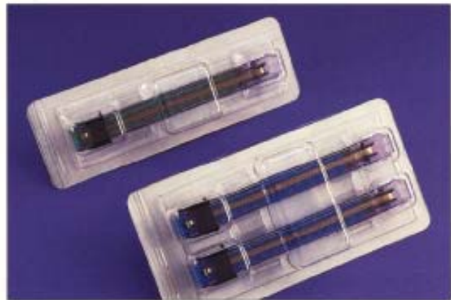
ACRACLIPs come in single cartridge or double cartridge sterile blisterpacks. Each cartridge contains 15 clips. See chart at left